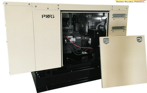
Optional Enclosure and Fuel Tank Pictured