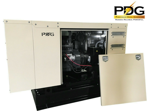
Optional Enclosure and Fuel Tank Pictured

Kubota Powered 12,500 Watt Diesel Generator - Whether for a work site, cabin, lodge, or standby emergency power, this Kubota diesel will do the job every day. Day after day. This unit operates at 1800 RPM and with its super quiet muffler, acoustic dampening air intake system and 4 point vibration mounts, runs smooth and quiet.