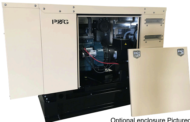
Optional enclosure Pictured

Kubota V1505BG Engine EPA TIER 4 Compliant