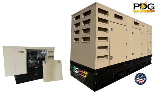
PDG Enclosures are made with Aluminum and are coated with industrial grade synthetic powder coat for maximum durability. Fasteners, hinges, latches are stainless steel..