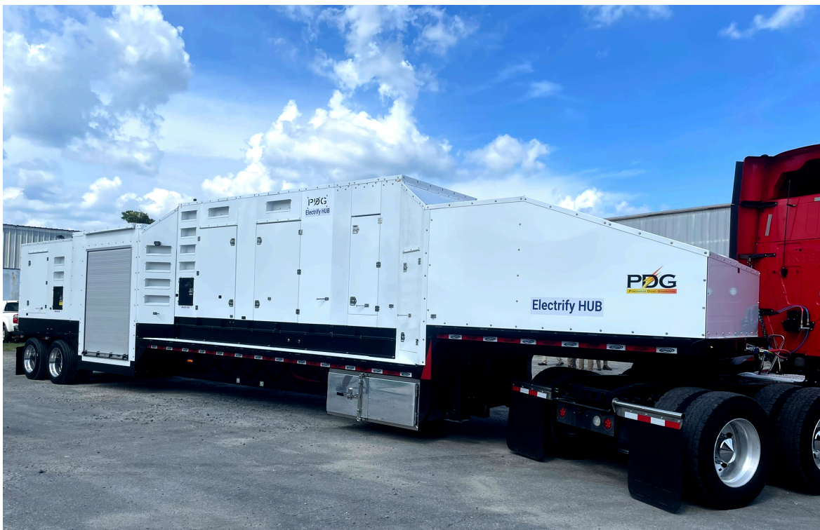
Various Optional D.O.T. Trailer Configurations Available