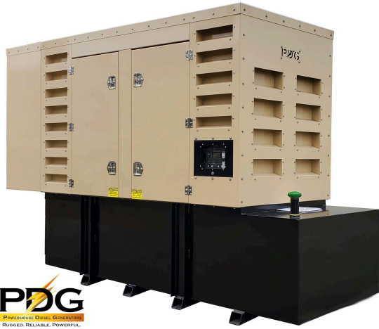
Custom D.O.T. and UL Tanks For all Applications