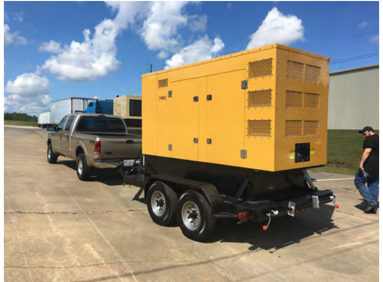
Various Optional D.O.T. Trailer Configurations Available